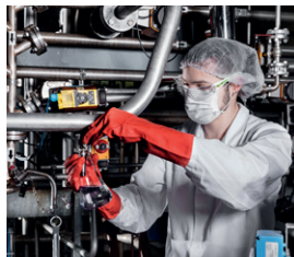
Carboxylic Acid Derivatives