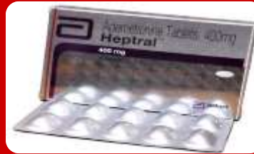
Low RH Technology Products