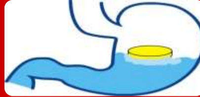
Gastric Floating Tablets