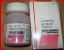
Ready to use Antibiotic Syrup