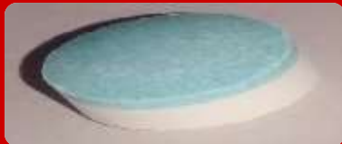
Multi color Bi-layered Tablet