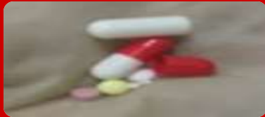
Multiple Tablets in Capsule