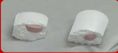
Tablet in Tablet