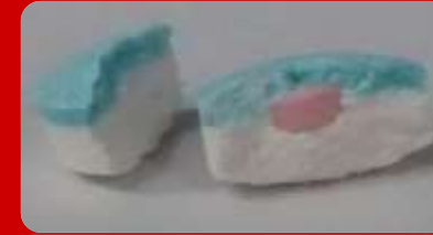
Bi-layered + Sustained Release + Tablet in Tablet