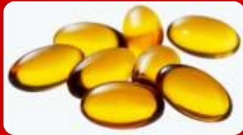
Liquid Vitamins in Soft Gelatin