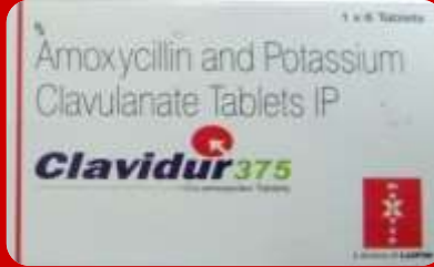
Low RH and Clavulanic Preparations