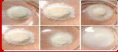
Mouth Dissolving Tablet and Powder