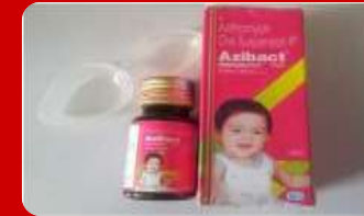
Taste Masking of Bitter Drugs