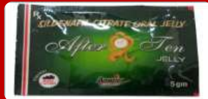
Medicinal Jellies In palatable taste