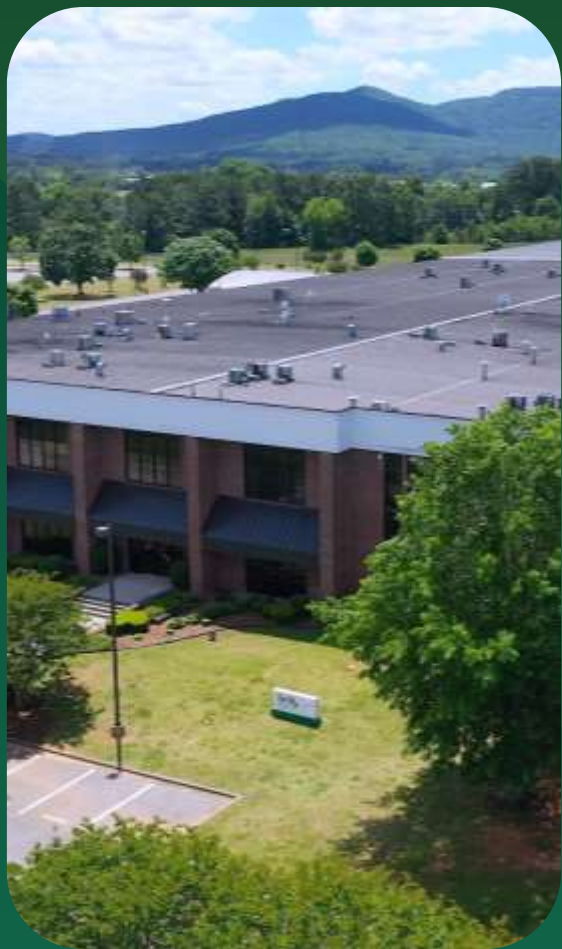
HUNTSVILLE, AL, US