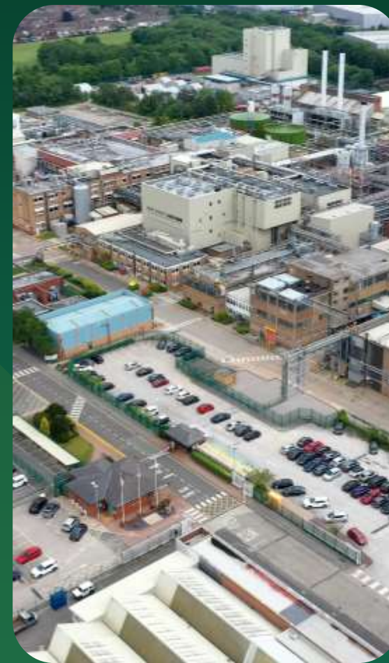
SPEKE, LIVERPOOL, UK