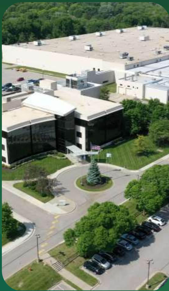
SHAWNEE, KS, US