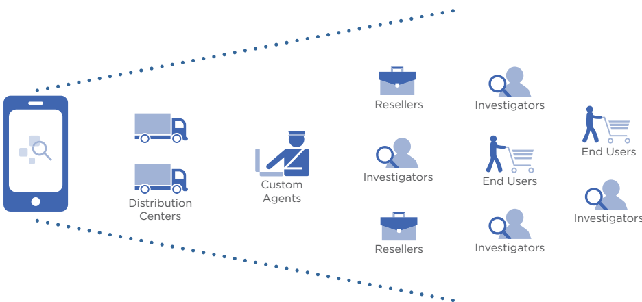
UniSecure provides authentication to each stakeholder throughout the full product life cycle.

Counterfeiters are becoming increasingly sophisticated allowing them to easily defeat current anti-counterfeiting technologies. Systech UniSecure™ is a proven, non-additive authentication solution. It derives a unique signature, therefore it cannot be reengineered.