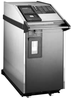
Figure 1. VHP 1000 Mobile Biodecontamination Systems

Walter Reed Army Institute for Research is a U. S. government laboratory facility located in the Washington D.C. area.