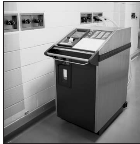
Figure 2. VHP Inlet/Outlet Ports

All rooms contain at least one pair of inlet/outlet ports to deliver and return VHP. More than one pair of inlet/outlet ports were installed on some of the larger volume rooms in case more than one