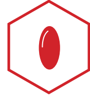
Soft Gel Capsules