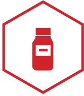
Antacid & Laxative Ingredients