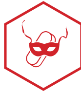
Taste Masked Actives