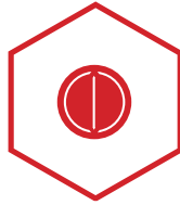
Chewable Tablets & Lozenges