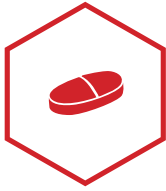
Excipients for Swallow Tablets