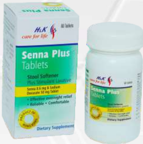
Senna ( White Sugar Coated )