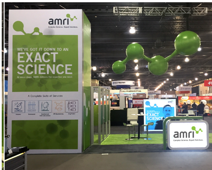
Trade Show Booth