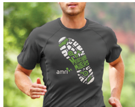
AMRI Company T-shirt

Through the FSP relationship, SCORR worked with AMRI's internal communications department as a unified team to develop and execute the brand launch plan. After honing the core messaging, SCORR presented the new branding elements at an AMRI town hall meeting. AMRI achieved its goal of garnering internal buy-in from its legacy companies. Employees became brand advocates, which included participation in community events as part of an AMRI team (such as running local races as the Molecular Milers) and social sharing via their personal social media accounts. They also took pride in their rebranded trade show presence.