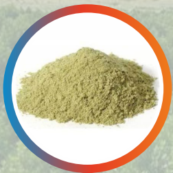
Podophyllotoxin 50% BP Resin