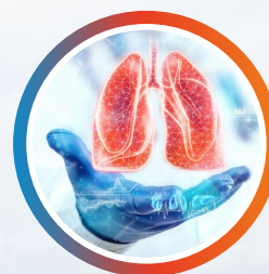
Docetaxel Trihydrate & Anhydrous IP/USP/EP DMFs Ready