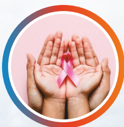
Paclitaxel IP/USP/EP DMFs Ready