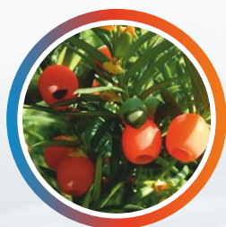
10-Deacetylbaaccatin III (Starting Material for Taxol Derivatives)