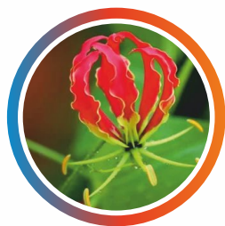
Thiocolchicoside FP/IP/EP Crystallize by Ethanol/EP Hydrate US DMF no. 26130 CEP/COS Applied