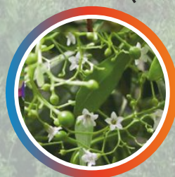
Hyoscyamine Butyl Bromide IP/BP/EP DMFs Ready