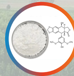
4 De Methyl Epi Podophyllotoxin (Starting Material for Etoposide)