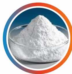
Colchicine EP/USP/BP CEP no. 2019-056-P01 US DMF no. 24525