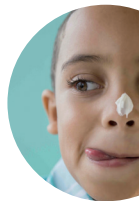
Food & Nutrition