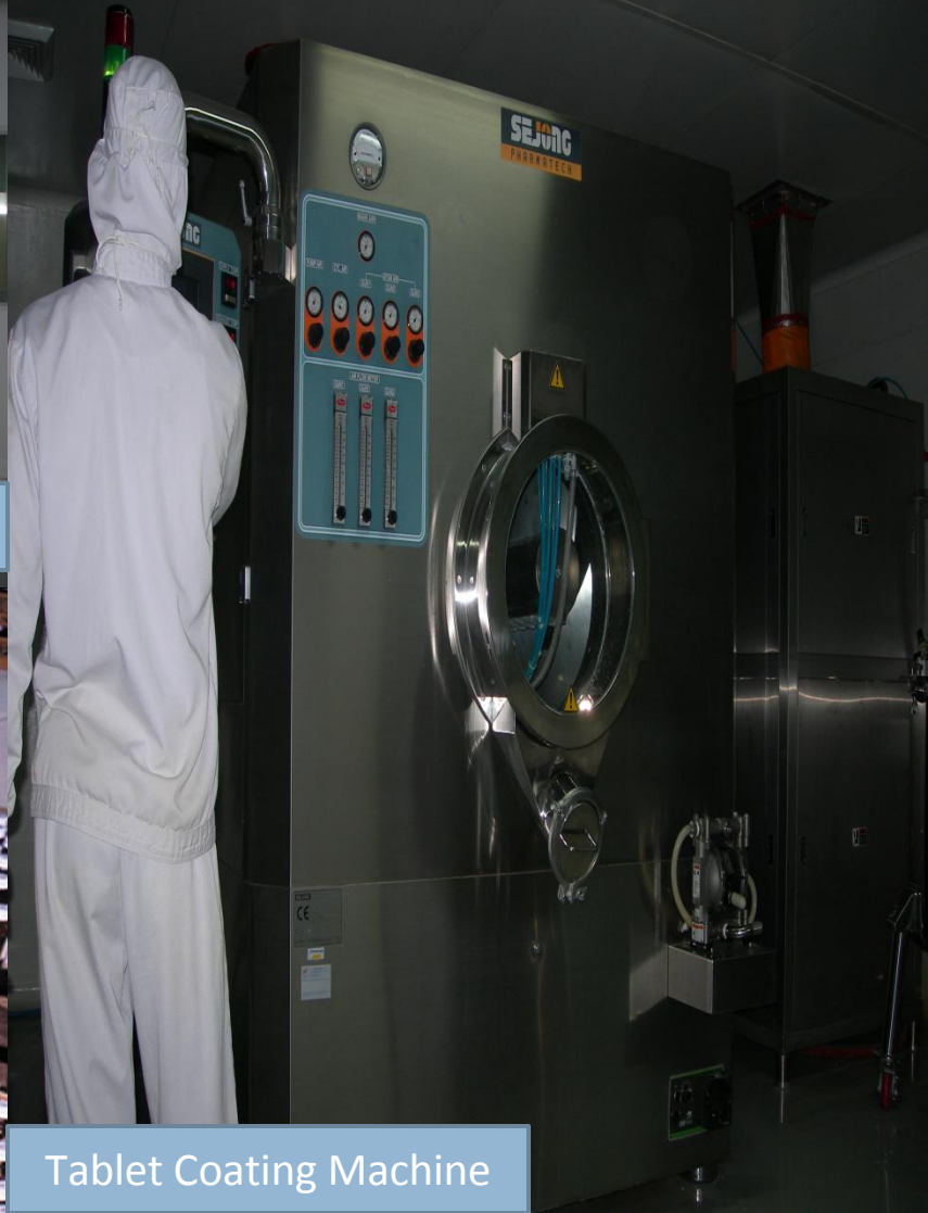
Tablet Coating Machine