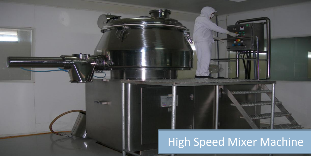
High Speed Mixer Machine