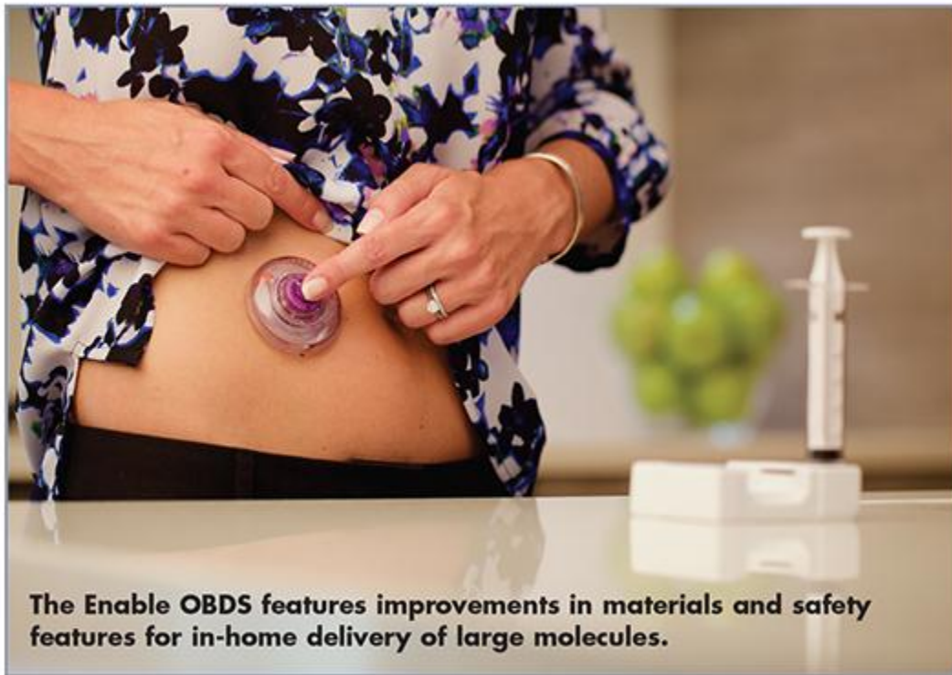
The Enable OBDS features improvements in materials and safety features for in-home delivery of large molecules.

“Advancements with wearable injectors offer the opportunity to revolutionize biological therapy treatments, especially those treating chronic conditions that struggle to attain positive clinical outcomes due to patient adherence,” says Mr. Hooven.