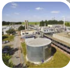
VERT-LE-PETIT (Plant, R&D Center, HQ)