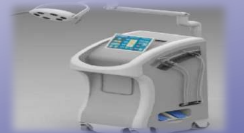
Automatic Hair Transplant System