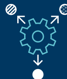
Platform Technologies: Hot Melt Extrusion