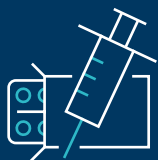
Drug Products / BD & Licensing