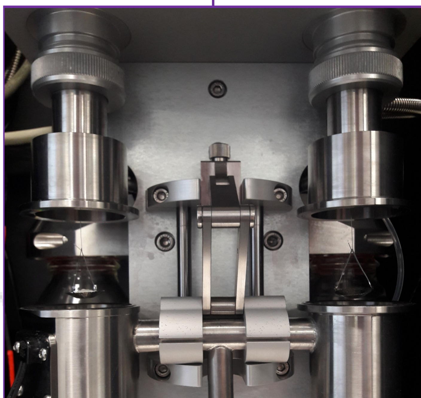
Dynamic Vapour Sorption Aqueous & Organic