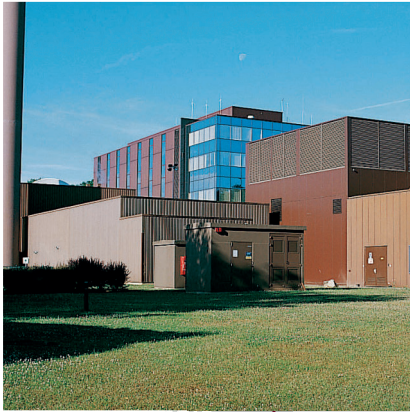
VALDEPHARM Val-de-Reuil - France