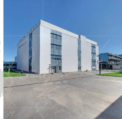
EXCELLA Feucht - Germany