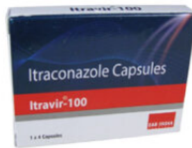
ITRAVIR 100 CAPSULES