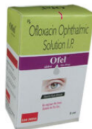
OFEL EYE/EAR DROPS