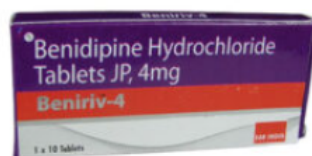
BENERIV 4 TABLET