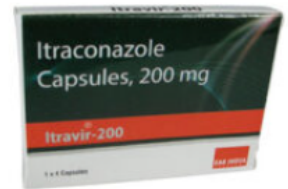
ITRAVIR 200 CAPSULES