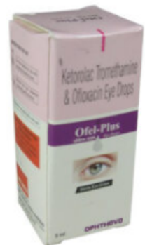
OFEL PLUS DROPS