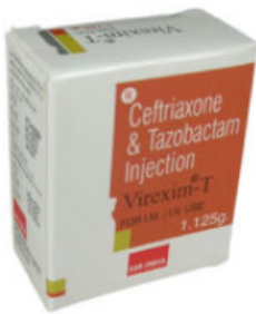
VIREXIM-T 1.125g. INJECTION