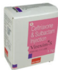
VIREXIM-S 1.5g. INJECTION