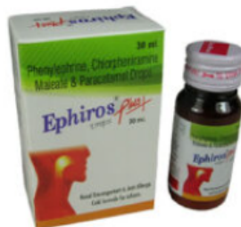
EPHIROS PLUS DROP