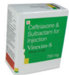
VIREXIM-S 750 mg. INJECTION