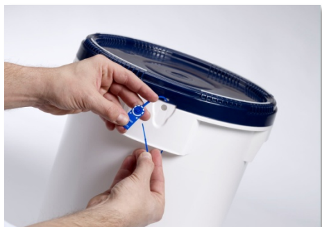
The pull tight security seal is a good way of protecting plastic containers of chemicals or pharmaceuticals. Both the lid and body of the container are secured tightly together using the security seal, which must be cut to gain access to the contents.

In this article we examine what technology and innovation can offer for the security of bulk containers of APIs (active pharmaceutical ingredients) during the manufacturing process. Bulk containers are available in various shapes and sizes and also in different materials, from nestable polymer containers with screw on or snap on lids to bulk steel drums. The choice of container depends on the format of the material being transported, the quantity, the capacity of the container and the required level of protection and cleanliness or purity. The first level