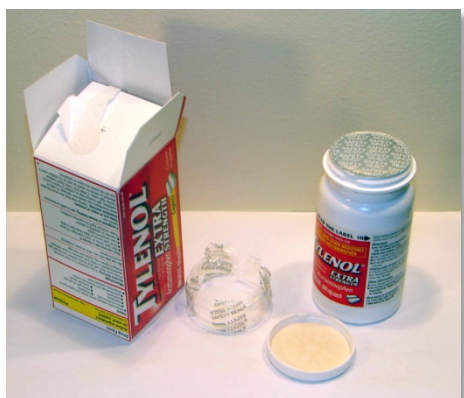
The Tylenol crisis in the US was a wake-up call for pharmaceutical and food companies. This prompted the introduction of plastic banding seals around screw lids and also internal foil safety seals to combat any tampering with products.

In these cases a shrink sleeve was added and the integrity of the sealed top increased.