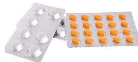
Blister/ doble-soft aluminum