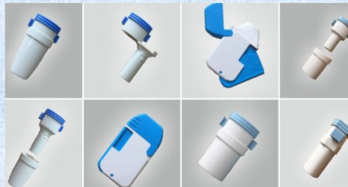
DRY POWDER INHALERS