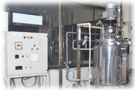
2 x 100 Ltr Fermenters