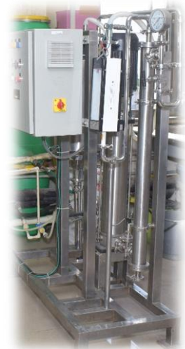
Nano filtration (Pilot)