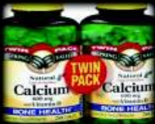
Consumer Health Nutritional