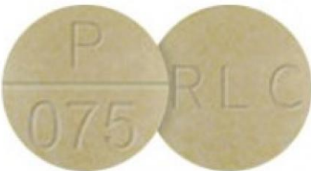
WP Thyroid® 1.25 grain