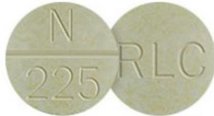
Nature-Throid® 2.25 grain