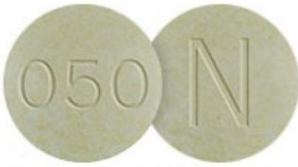
Nature-Throid® 0.50 grain