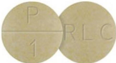
WP Thyroid® 1.00 grain