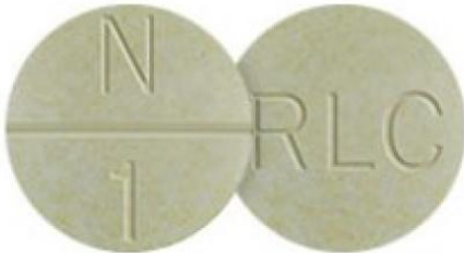
Nature-Throid® 1.00 grain