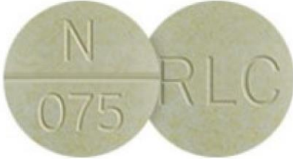
Nature-Throid® 0.75 grain