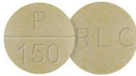
WP Thyroid® 1.50 grain