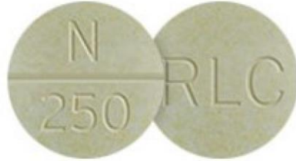
Nature-Throid® 2.50 grain