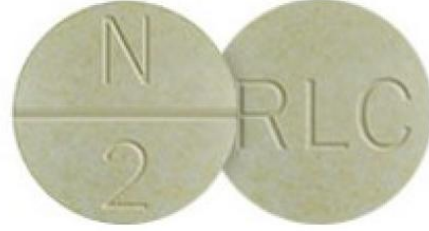
Nature-Throid® 2.00 grain