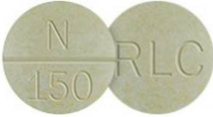
Nature-Throid® 1.50 grain