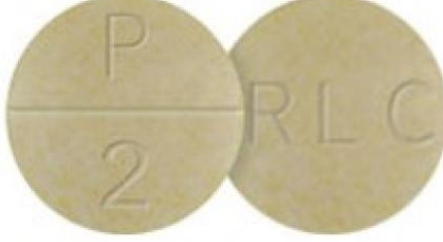
WP Thyroid® 2.00 grain