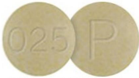
WP Thyroid® 0.25 grain