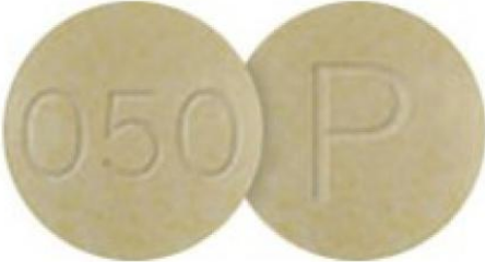
WP Thyroid® 0.50 grain