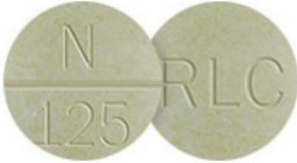
Nature-Throid® 1.25 grain