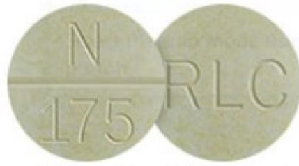
Nature-Throid® 1.75 grain