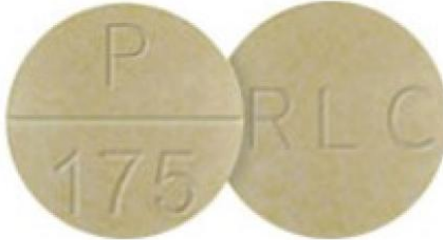
WP Thyroid® 1.75 grain