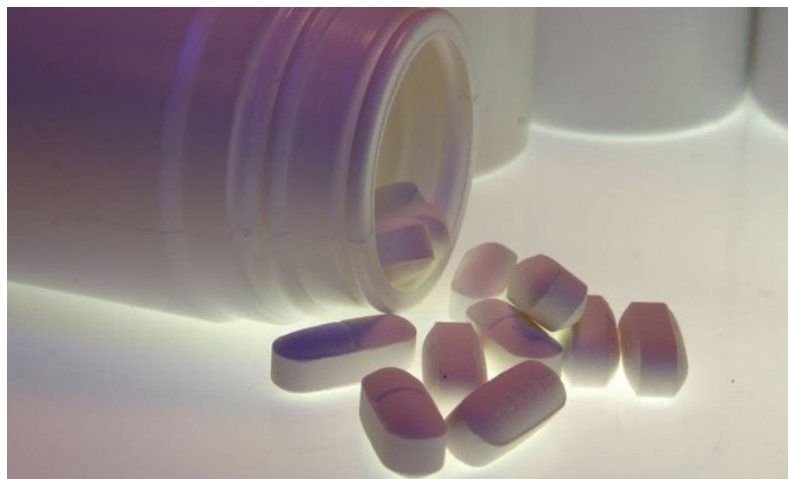
All valid lots of the antibiotic Protectina are suspended - Disclosure / Anvisa

RIO - Anvisa has ordered the suspension, marketing and use of all valid lots of the antibiotic Protectin (doxycycline hyclate), hard gelatin capsules with microgranules, in all